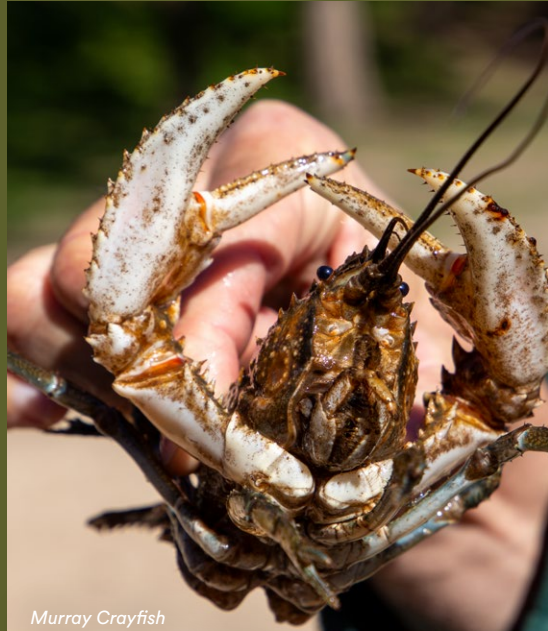
Murray Crayfish