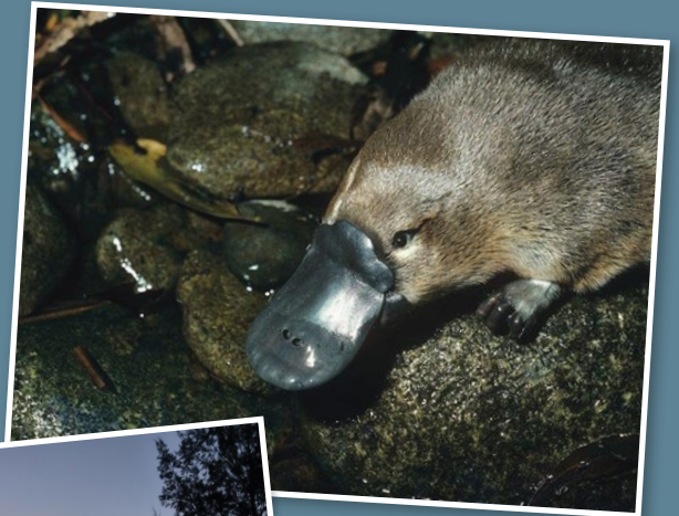
Above, photo credit: Bush Heritage Australia, taken by Jiri Lochman

Did you know... that a group of platypuses is called a paddle! Seems very fitting for these interesting critters.