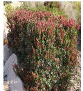
Callistemon 'Red Alert'