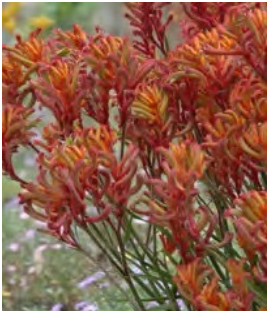
Angiozanthus 'Bush Gem'