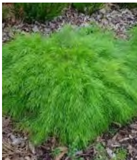
Acacia cognata 'Limelight'