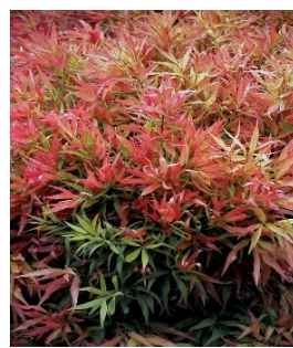
Callistemon 'Balls of Fire'