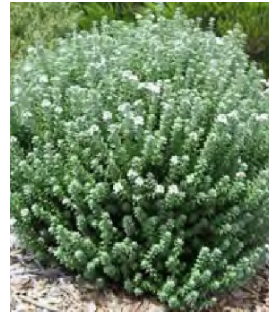
Westringia 'Grey Box'