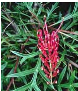
Grevillea 'Bronze Rambler'