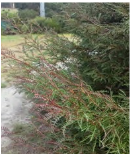
Grevillea 'Poorinda Peter'