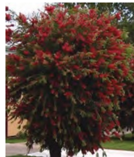
Callistemon 'Kings Park'