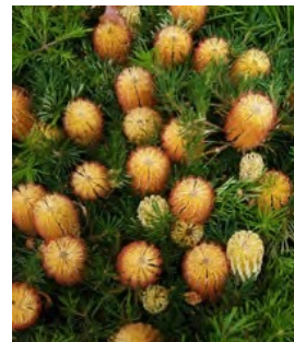
Banksia 'Birthday Candles'