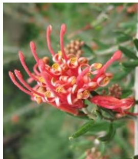
Grevillea 'Poorinda Queen'