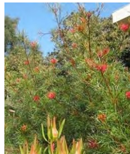
Grevillea 'Red Hooks'