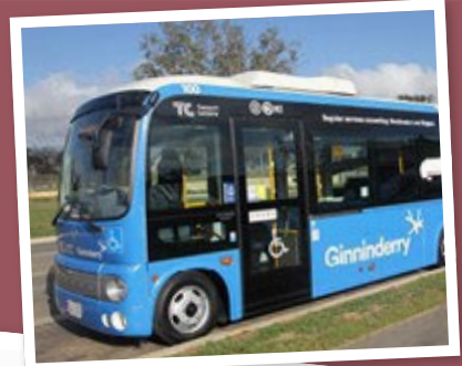
Data for the bus trips taken over time

Any data nerds or Active Travel aficionados out there? TCCS has been tracking bus use since April 2020, and we thought we'd share some of the results. It's fantastic to see the increase in numbers over time. Equally interesting to see the big drops in use during Covid lockdowns. The total passenger trips as of 11 February is 23,669 trips with many trips being made by school students. This means that there are currently about 192 bus trips and 7-8% of residents are catching the bus each workday. This is slightly higher than the average percentage of public transport users in Canberra, as reported in the 2016 Census. Ginninderry's blue bus is a free shuttle bus service that runs directly to Kippax Shops and drops off at Kingsford Smith School and MacGregor Primary. Look up route 903 on www.transport.act.gov.au to get the latest times.