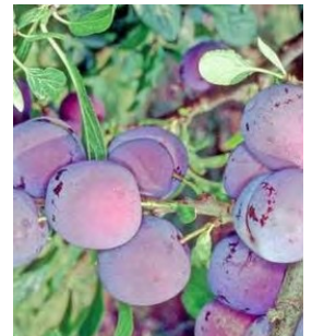
Prunus salicina - fruit