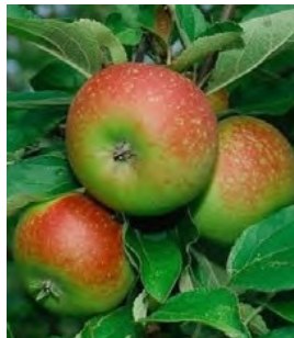
Malus domestica – fruit